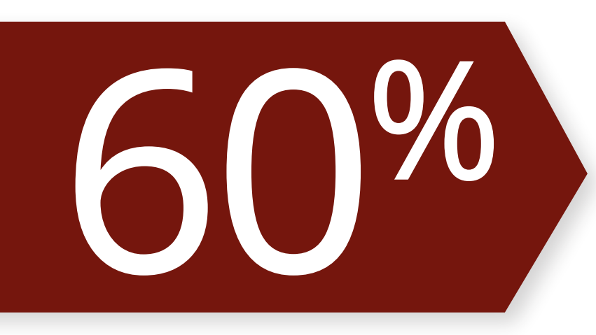
Own a device that is not password protected